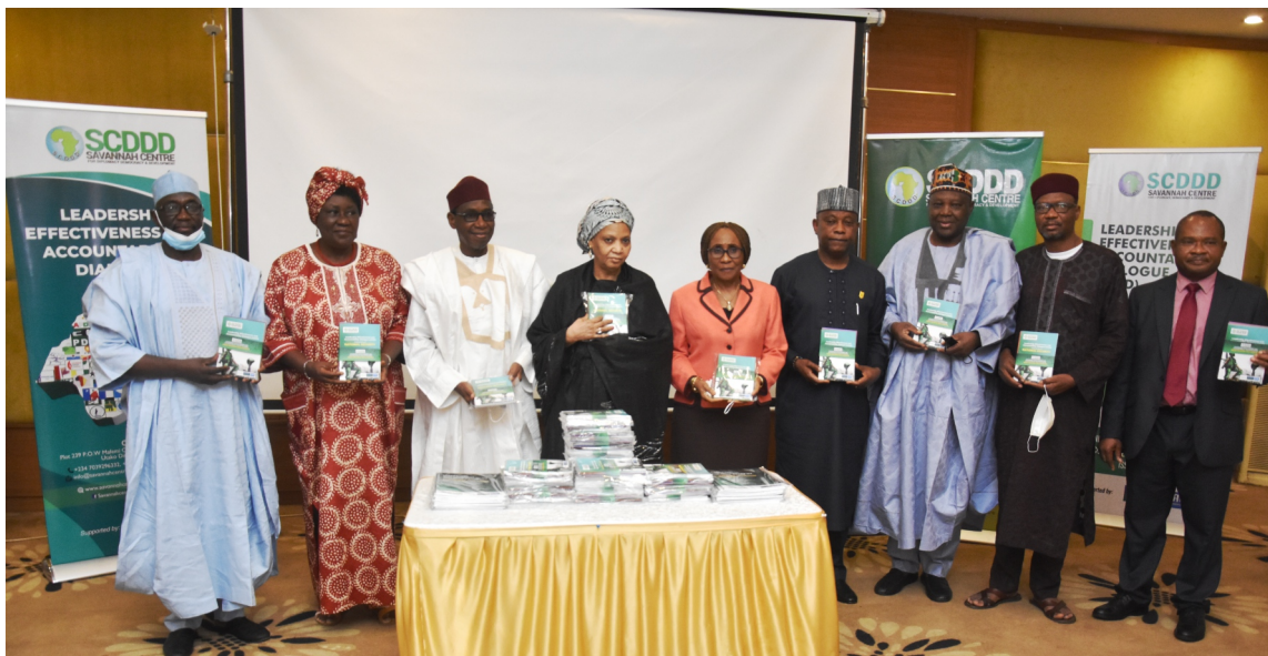
Savannah Centre for Diplomacy, Democracy, and Development, Abuja, Nigeria. June, 2022.

It is our belief that through the contribution of Savannah Centre towards a peaceful and violence-free electioneering process in Nigeria, democratic stability would deepen and ultimately lead to sustainable development and growth of the country.